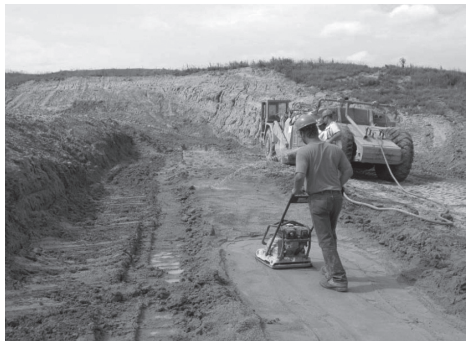
A BSB worker tamps down moistened soil on Tier 14 on Flood Control Structure 80A north of Maywood.

Hicks says that Tiers 11 through 14 were completed by last Thursday evening, July 22nd. Friday work will concentrate on bringing the earth-fill up to the elevation on tier 14. The structure will consist of 25 tiers.